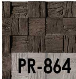
Alfa Marrón / Alfa Brown