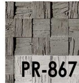
Alfa Gris Viejo / Alfa Old Grey