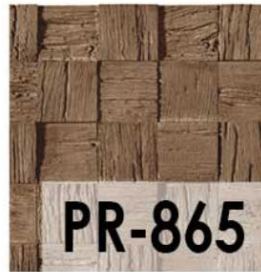
Alfa Marrón Arena / Alfa Sandy Brown