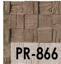
Alfa Marrón Viejo / Alfa Old Brown