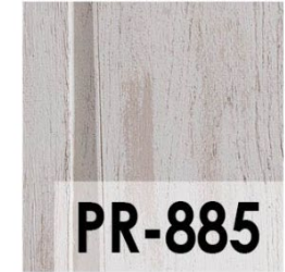
Rosa Pátina / Patina Pink