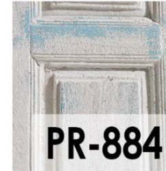
Azul Pátina / Patina Blue