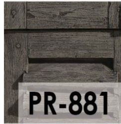
Marrón Viejo / Old Brown