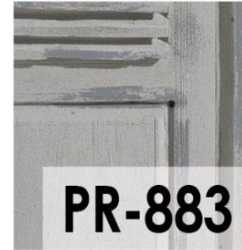
Gris Pátina / Patina Grey