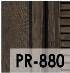
Marrón / Brown