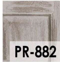
Marrón Pátina / Patina Brown