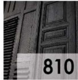
810 Antracita / Anthracite