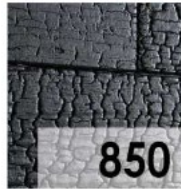
Antracita / Anthracite