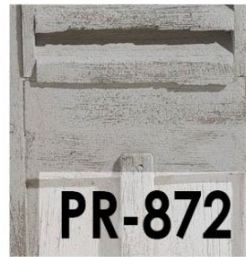
Marrón Pátina / Patina Brown