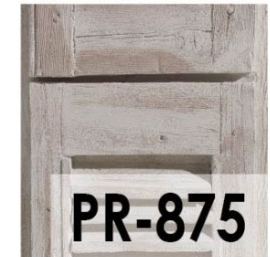
Rosa Pátina / Patina Pink