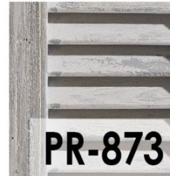
Gris Pátina / Patina Grey