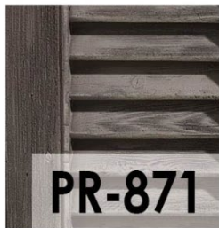
Marrón Viejo / Old Brown