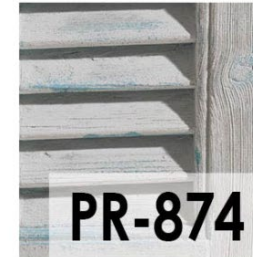
Azul Pátina / Patina Blue