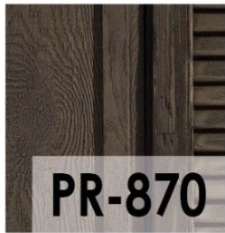
Marrón / Brown