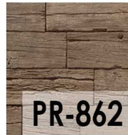
Marrón Viejo / Old Brown