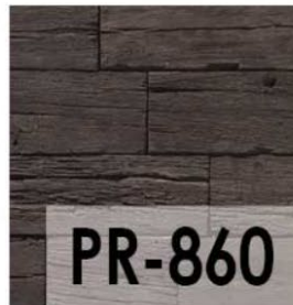
Marrón / Brown