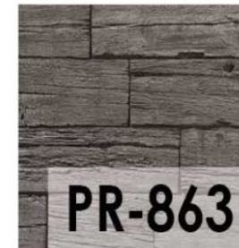
Gris Viejo / Old Grey