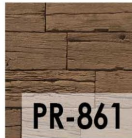
Marrón Arena / Sandy Brown