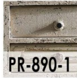
PR-890-1 Craquelado Blanco / Cracked White