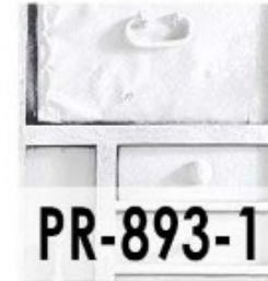
PR-893-1 Blanco Italia / Italia White