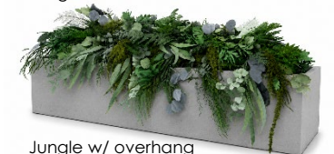
Jungle w/ overhang